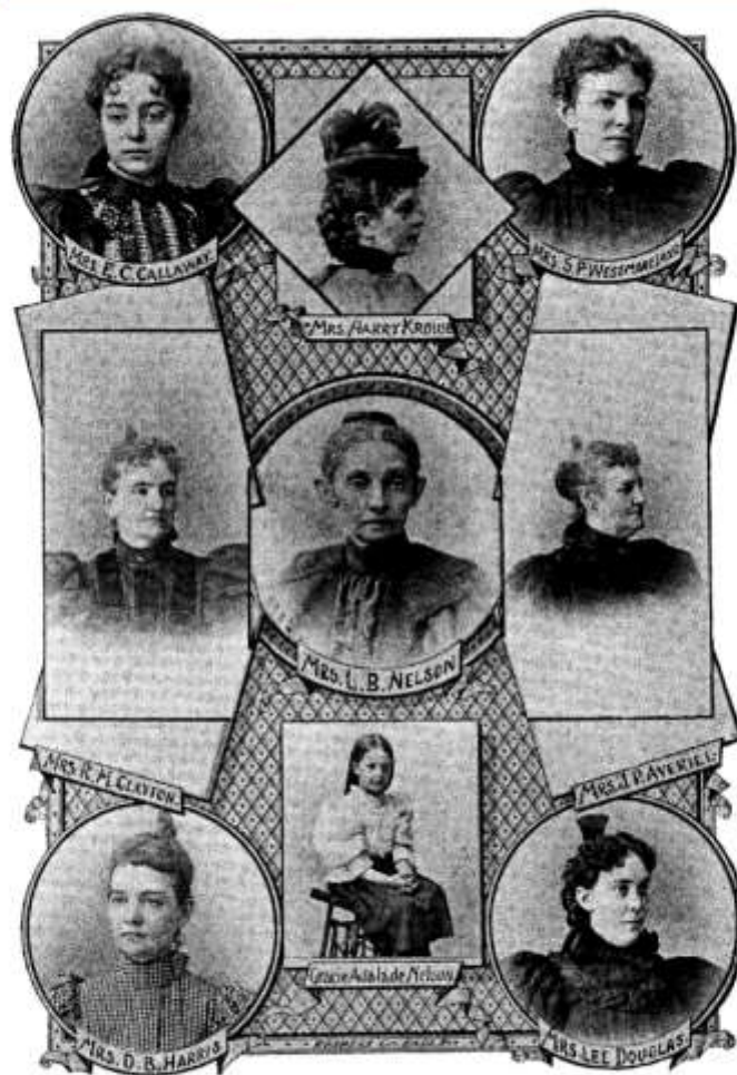
OFFICERS DONE FOR THE FRIENDLESS.